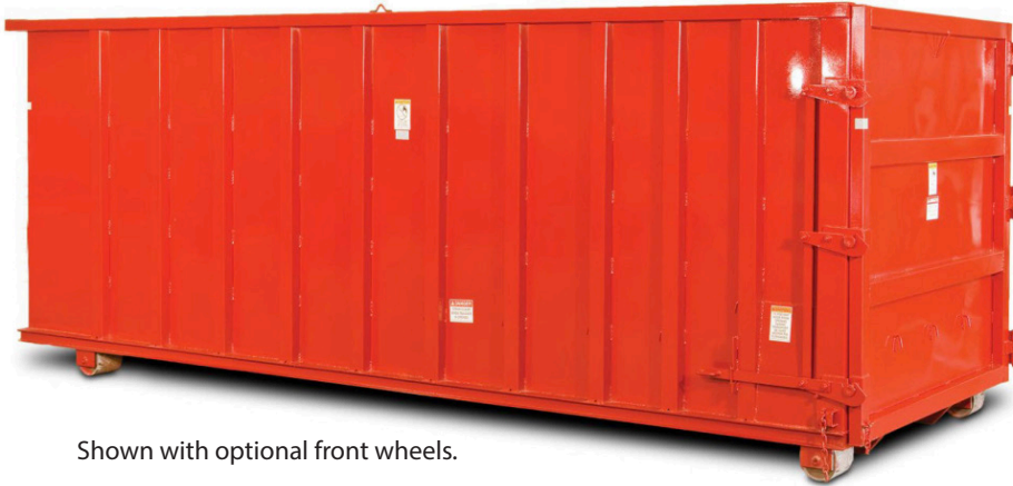
Shown with optional front wheels.

Sizes: 20, 30, or 40-cubic yards (other models available)