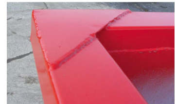
10 gauge front-to-side wall corner wraps provide added strength.

Construction and remodeling, landscaping, industrial, or residential clean-up. Extra heavy-duty models available for construction, demolition, and scrap metal applications.