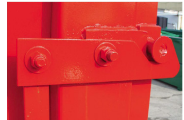
Optional ratchet-style rear door closing device secures the container.