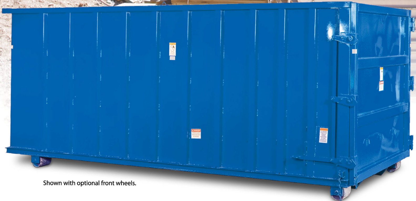
Shown with optional front wheels.