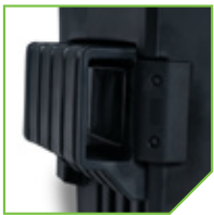
Replaceable, double-walled lift pockets for easy maintenance