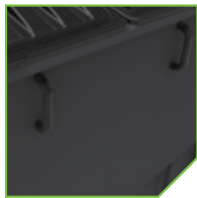
Optional comfort & grip handles for easy maneuverability