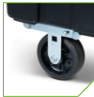
Replaceable double-walled bumpers for long-lasting durability